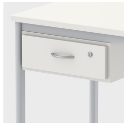
Including practical drawer under the table top