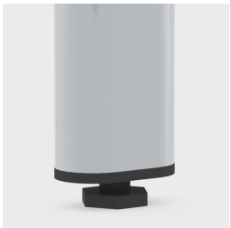
Floor protector with level compensation for easy levelling of uneven floors