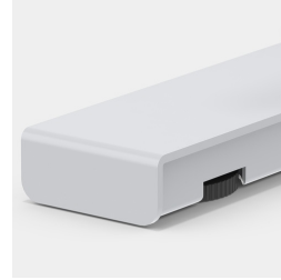
Floor protectors with level compensation for easy leveling of uneven floors