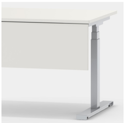
Matching accessories: front panel model 2050.202