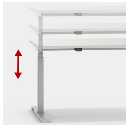
Infinitely and quietly height adjustable in the range 62-127 cm