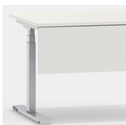
Matching accessories: front panel model 2050.202 and side panel model 2050.162