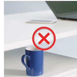
Collision protection minimizes the risk of damage when moving up and down