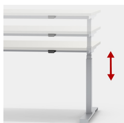
Infinitely and quietly height adjustable in the range 62-127 cm