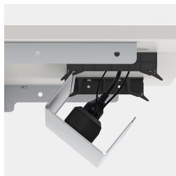
Concealed cable management through foldable cable tray