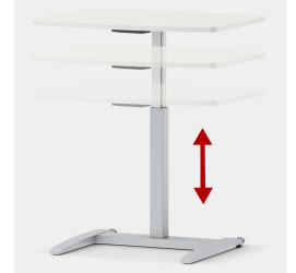
Infinitely variable height adjustment in the range 70-110 cm