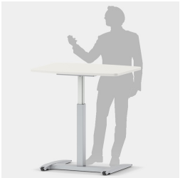
Can also be used as a mobile lectern