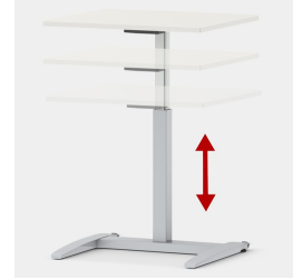
Infinitely variable height adjustment in the range 70-110 cm