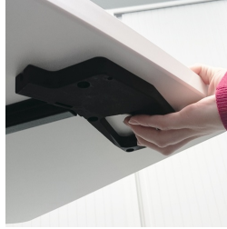
Safety hand release prevents unintentional triggering of height adjustment