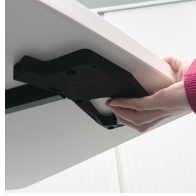
Safety hand release prevents unintentional triggering of height adjustment