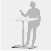
Can also be used as a mobile lectern