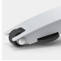
Mobile due to 2 casters on the rear edge of the base, with slight incline