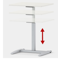
Infinitely variable height adjustment in the range 70- 110 cm