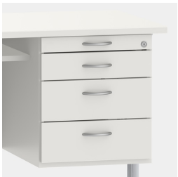
Base unit includes pencil drawer and drawers with soft-closing mechanism and central locking system