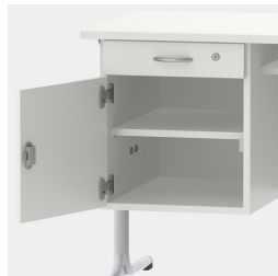
Base cabinet includes drawer, lockable by means of safety lock