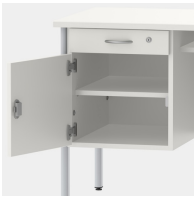
Base cabinet includes drawer, lockable by means of safety lock