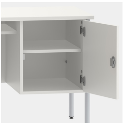
Base cabinet includes one shelf, lockable by means of security lock