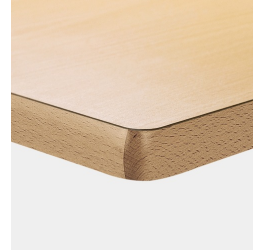
Optional melamine coated table top with solid wood edge