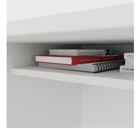
Including practical tray