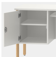
Base cabinet includes one shelf, lockable by means of security lock