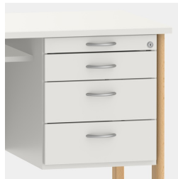
Base unit includes pencil drawer and drawers with soft-closing mechanism and central locking system