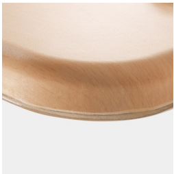
Optional WOODMARK table top in shatterproof quality