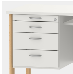
Base unit includes pencil drawer and drawers with soft-closing mechanism and central locking system