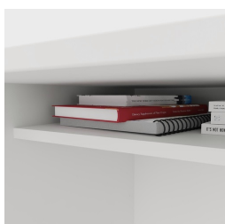
Including practical tray