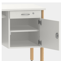
Base cabinet includes drawer, lockable by means of safety lock