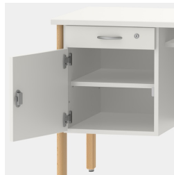
Base cabinet includes drawer, lockable by means of safety lock