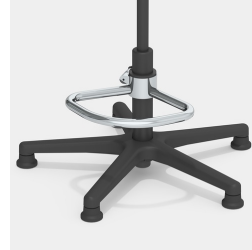
Optionally with partial foot ring