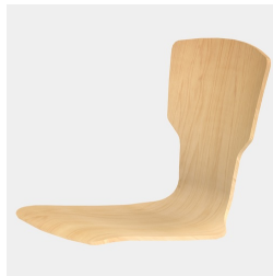
Body contoured seat shell