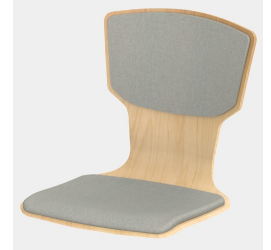
Optionally with seat and backrest upholstery