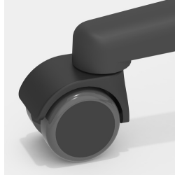
Optionally with load-dependent braked casters