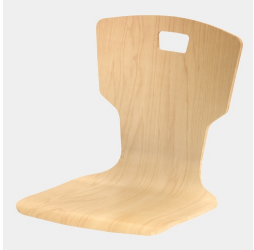
Optionally with handle hole in trapezoidal shape (not with backrest upholstery)