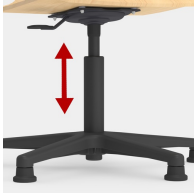
Height adjustment by safety gas spring