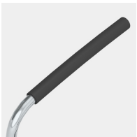
Including armrest with black softgrip cover