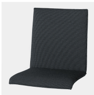
Body contoured seat shell with full upholstery