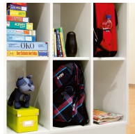
Compartments adapted to school satchels.