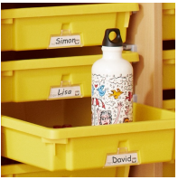
robust Tidy Boxes