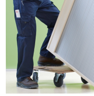
Carcass firmly doweled and glued ex works