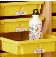
robust Tidy Boxes