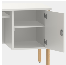
Base cabinet includes one shelf, lockable by means of security lock