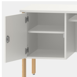
Base cabinet includes one shelf, lockable by means of security lock