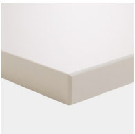
Board material melamine coated with robust plastic edge