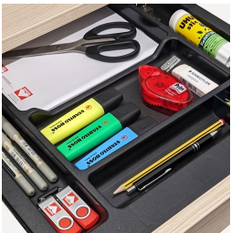
utensil drawer for office supplies