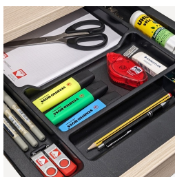
utensil drawer for office supplies