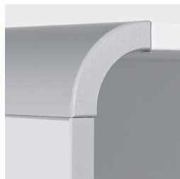
Rounded aluminum profile corners