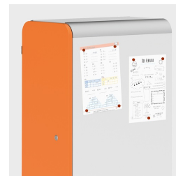
Optionally with magnetic pages