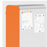
Optionally with magnetic pages