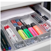
utensil drawer for office supplies