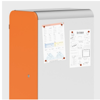
Optionally with magnetic pages