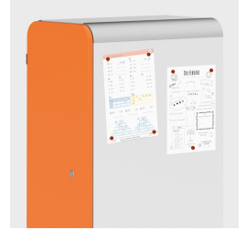
Optionally with magnetic pages