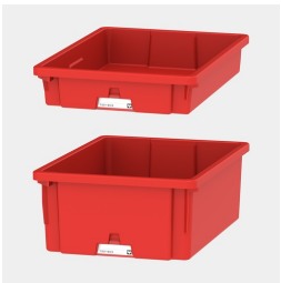
Tidy boxes for storing gloves, hats etc.