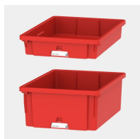
Tidy boxes for storing gloves, hats etc.