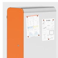
Optionally with magnetic pages