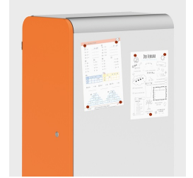
Optionally with magnetic pages