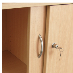
Smooth sliding doors