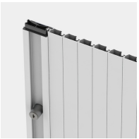
Stable guide rails