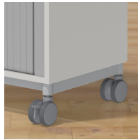
Pupil compartment shelves optionally mobile with castors.