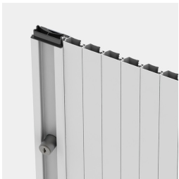
Stable guide rails