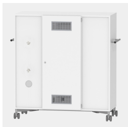
Lockable door for easy connection of the devices