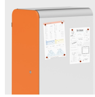
Optionally with magnetic pages