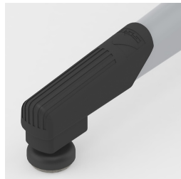
Floor protector with integrated step protection and level compensation