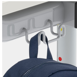
Includes one double satchel hook per seat