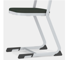
Stable and solid C-shape frame