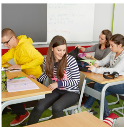
No disturbance of the chair legs when getting in and out of the chair