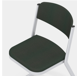
With seat and backrest upholstery