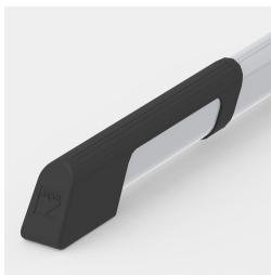
Floor protectors with integrated step protection