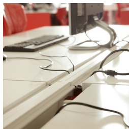
Plate slides on sliding fitting for concealed cable routing, sealed with rubber lip