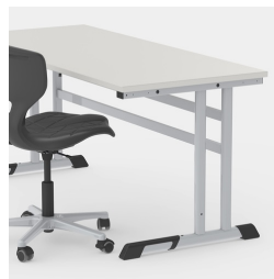
Due to C-shape no disturbance of the table legs when getting in and out of the table