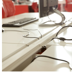
Plate slides on sliding fitting for concealed cable routing, sealed with rubber lip