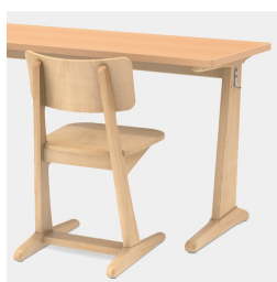
Due to C-shape no disturbance of the table legs when getting in and out of the table