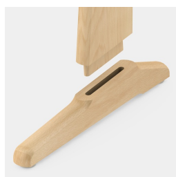
Durable and robust construction; firmly mortised and glued