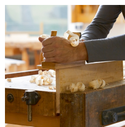
Solid beech wood from sustainable forestry with water-based varnish