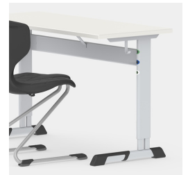
Due to C-shape no disturbance of the table legs when getting in and out of the table