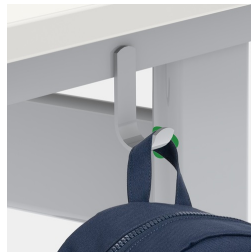
Includes one satchel hook per seat