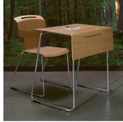
Slim cross section and modern design