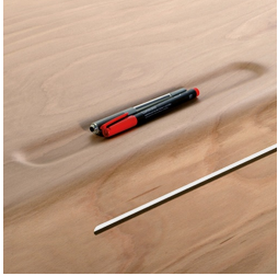
Pen tray included