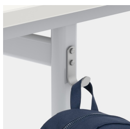
Includes one satchel hook per seat