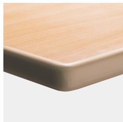
Optional melamine coated table top with ASSODUR® edge