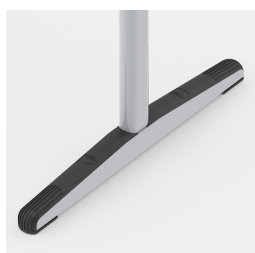
Floor protector with continuous step protection