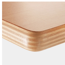
Optional table top multiplex melamine coated