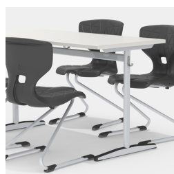
Seating on both sides due to central column frame