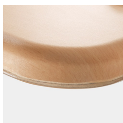
Optional WOODMARK table top in shatterproof quality