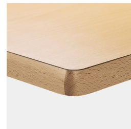
Optional melamine coated table top with solid wood edge