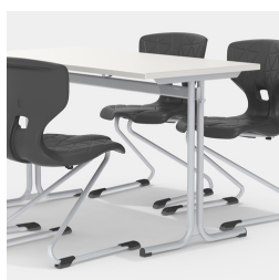
Seating on both sides due to central column frame