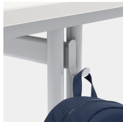
Includes one satchel hook per seat