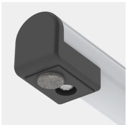
Optionally with felt floor protectors